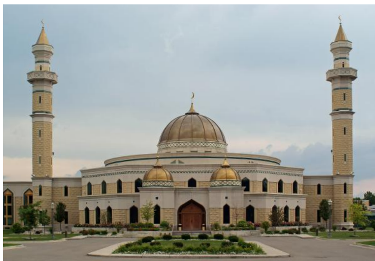
The Islamic Center of America in Dearborn, Michigan. This mosque was established in 1963 and is the largest Shia mosque in America.

The Nation of Islam (NOI), is one of the most significant organizations in African-American Muslim history. It began as a socioreligious movement that, though not entirely in line with the teachings of Islam, was effective in highlighting the difficulties in combating the effects of slavery and racism experienced by African-Americans. Two famous African-Americans, boxing great Muhammad Ali and human rights activist Malcolm X, were early adherents of this movement.