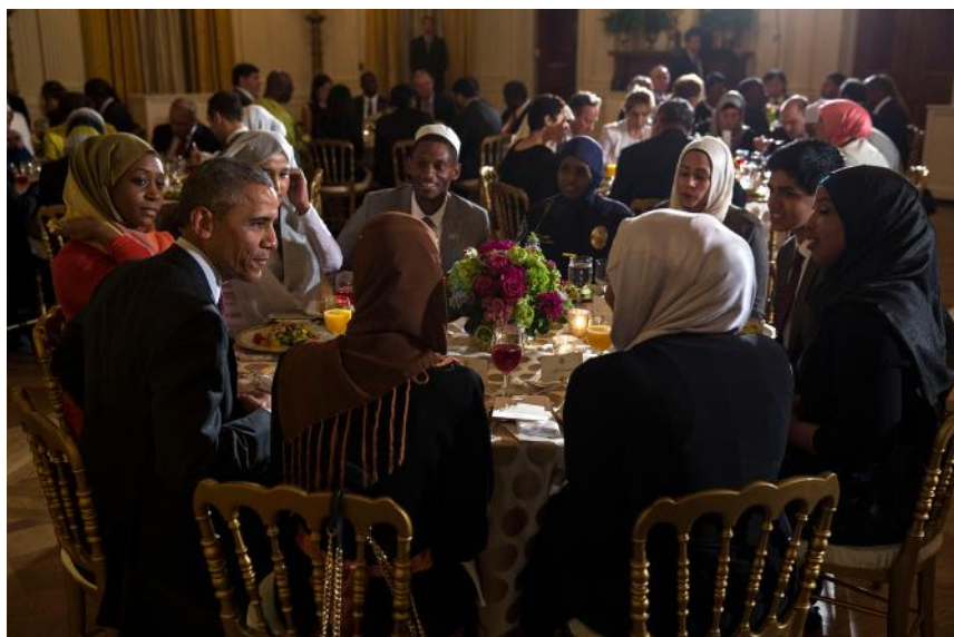
President Obama hosts iftar, the community meal that breaks the day-long fast Muslims observe during Ramadan.

Want to know more about healthy relationships? Contact WISE of the Upper Valley at wiseuv.org or 603.448.5922.