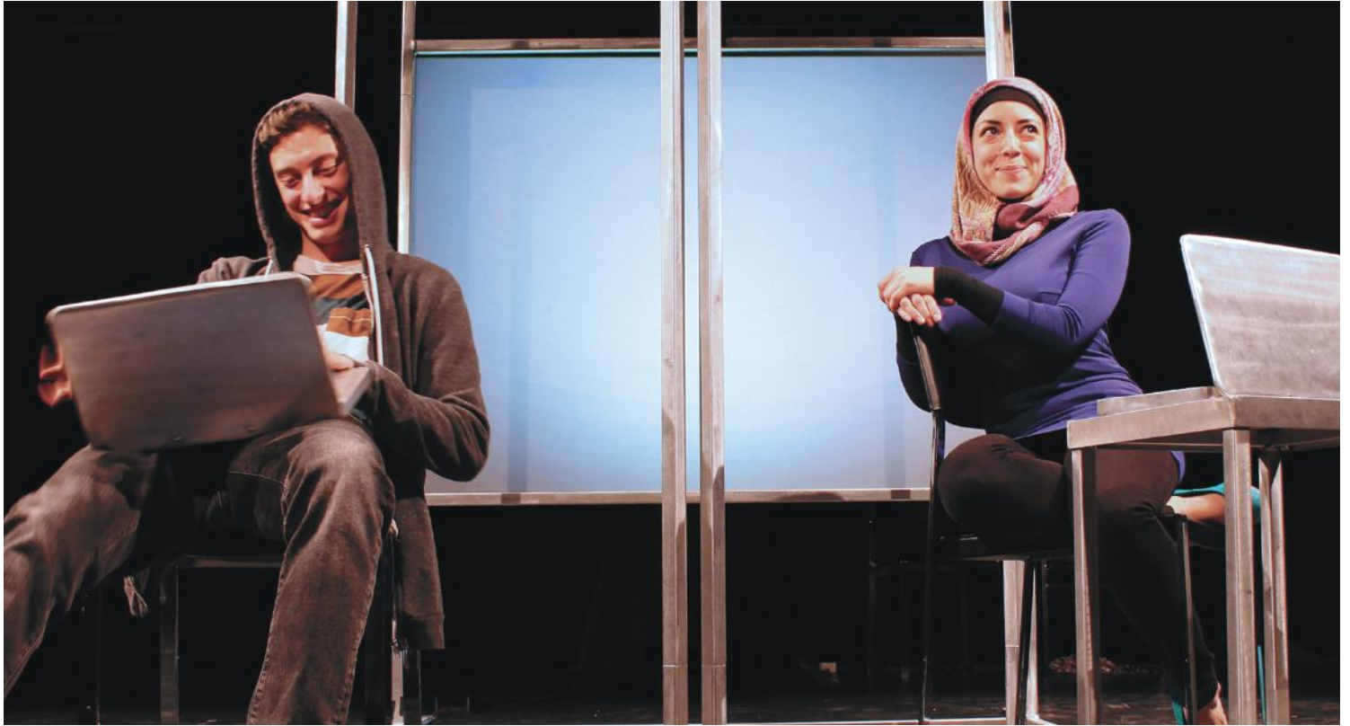
Jorah and Fatima

Let's say three actors play out a story that takes place in a high school. Let's say one of them plays an outgoing Egyptian-born girl who wears a hijab . Let's say her parents made her change schools recently because of some graffiti that said, "All Muslims must die," and that the guidance counselor at her new school, Mr. E, is doing his best to help her fit in. Let's say that a big part of his advice to her is to stay away from Jorah, a 10th grade guy who has challenges of his own, including a temper he inherited from his father who is in jail for beating up his mom. But let's say that maybe, just maybe, Fatima and Jorah start to, like, like each other, and Fatima begins to feel less like an outsider. Will the choices they make reflect the people they want to become, both for themselves and their families? This thought-provoking, comedic, and at times dark, play addresses issues of religion, stereotypes, abuse and racism, as well as the ways in which technology can affect relationships.